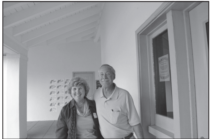
All Pintlala celebration photos courtesy of Patricia Boyd Killough.