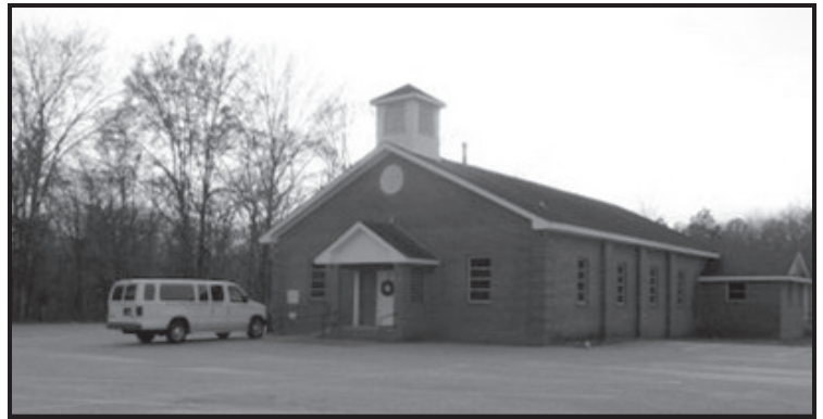
Beulah Missionary Baptist Church, Highway 31, Hope Hull, AL